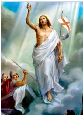
The Resurrection of Jesus Christ

Kristus vstal z mrtvých! Christ is Risen!! ¡Cristo ha Resucitado!