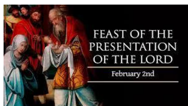
FEAST OF THE PRESENTATION OF THE LORD February 2nd