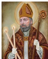
St. Blaise - Bishop & Martyr - February 3 -

Blaise was a physician and bishop of Sebaste in historical Armenia who is venerated as a Christian saint and martyr. Blaise is venerated as a saint in the Roman Catholic, Eastern Orthodox, and Oriental Orthodox churches and is the patron saint of wool combers and throat disease.