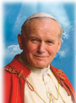
St. John Paul II Pope

**No Adoration this Thurs, Oct 24, due to Parish Mission.