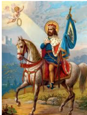
St. Wenceslaus Feast Day ~ September 28

September 22 – 28: Keith Youngpeter September 29 – October 5: Kathy Windhauser