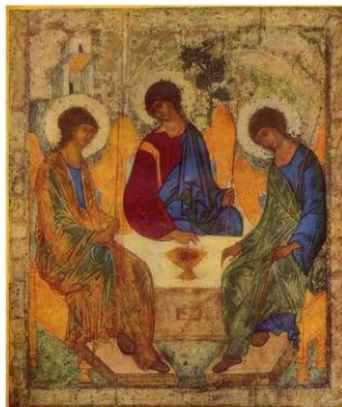
Lukáš Doříčák Veřovice 521

Tys můj sklání štít a pevná tvrz má, veď mě pro své jméno a doveď mě k cíli. Ži 31,4