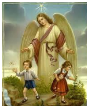
The Holy Guardian Angels Feast Day ~ October 2