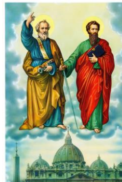
Feast Day of Sts. Peter & Paul June 29

Mon, July 3 – Senior Supper @ 6:30 pm in PAC