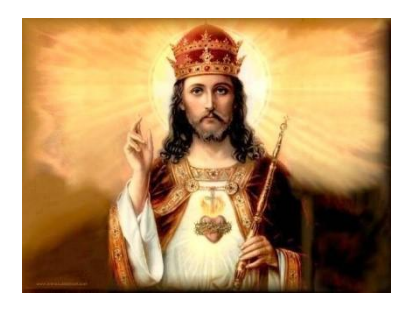
Christ the King