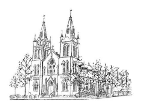
DEDICATION OF THE LATERAN BASILICA IN ROME NOVEMBER 9, 2014