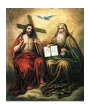
MOST HOLY TRINITY